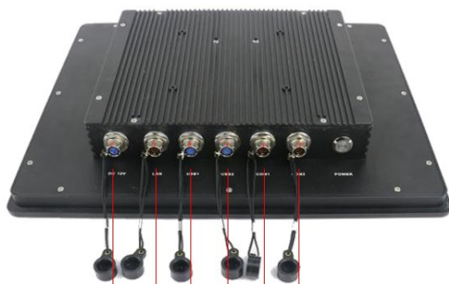
DC 12V LAN USB1 USB2 COM1 COM2